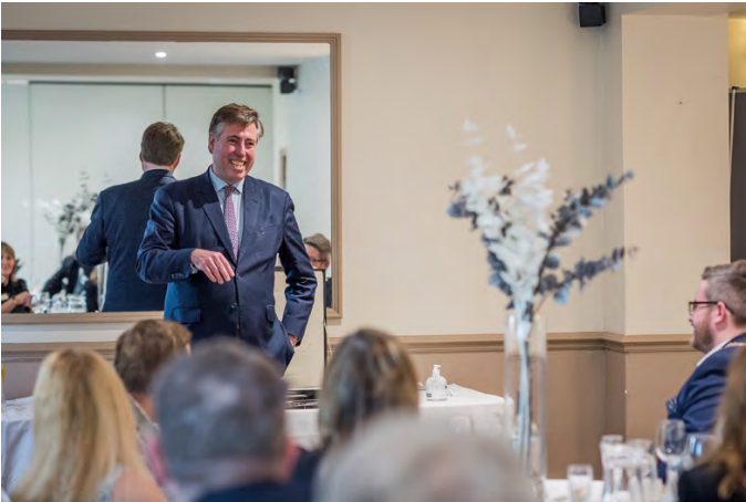
Sir Graham Brady MP Patron of ASCC