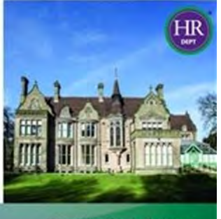
Preventing People Problems

Management Training Managing Absence and Employee Wellbeing Tues 19th Sept 9.30 am - 1 pm Denzell House, Altrincham